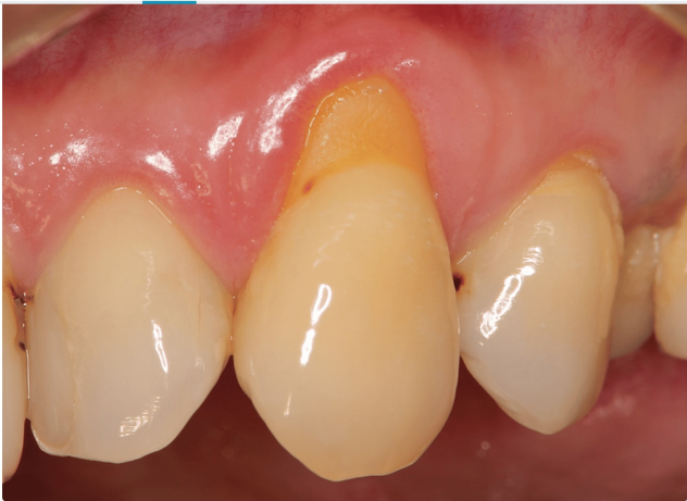
Figure 1: Preoperative image in Case 1 Gums are inflammation-free, plaque control is good, and periodontal pockets are \leq 3 mm.

Cite this article as: Ando K, Ando D, Kojima Y (July 22, 2024) A Novel and Minimally Invasive Approach Using the Root and Cervical Margin Flattening Procedure for Treating Gingival Recession: A Report of Four Cases. Cureus 16(7): e65142. doi:10.7759/cureus.65142