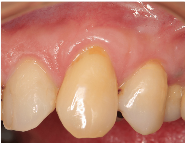
Figure 9: Postoperative image after 12 months in Case 1